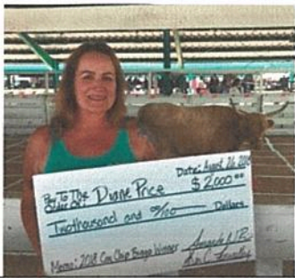
2018 SFHA COW CHIP BINGO WINNER!!!